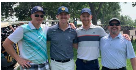
Team ZebraTech 2021